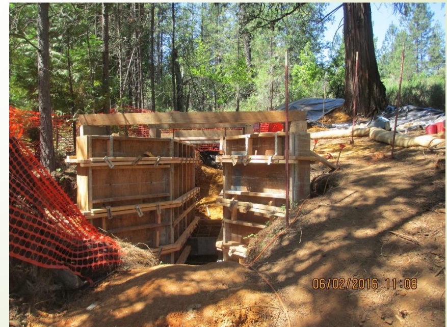
Measuring Weir at Allison Ranch Rd.