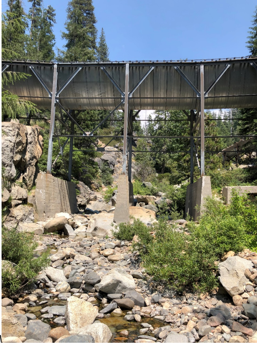
Fall Creek Crossing Flume