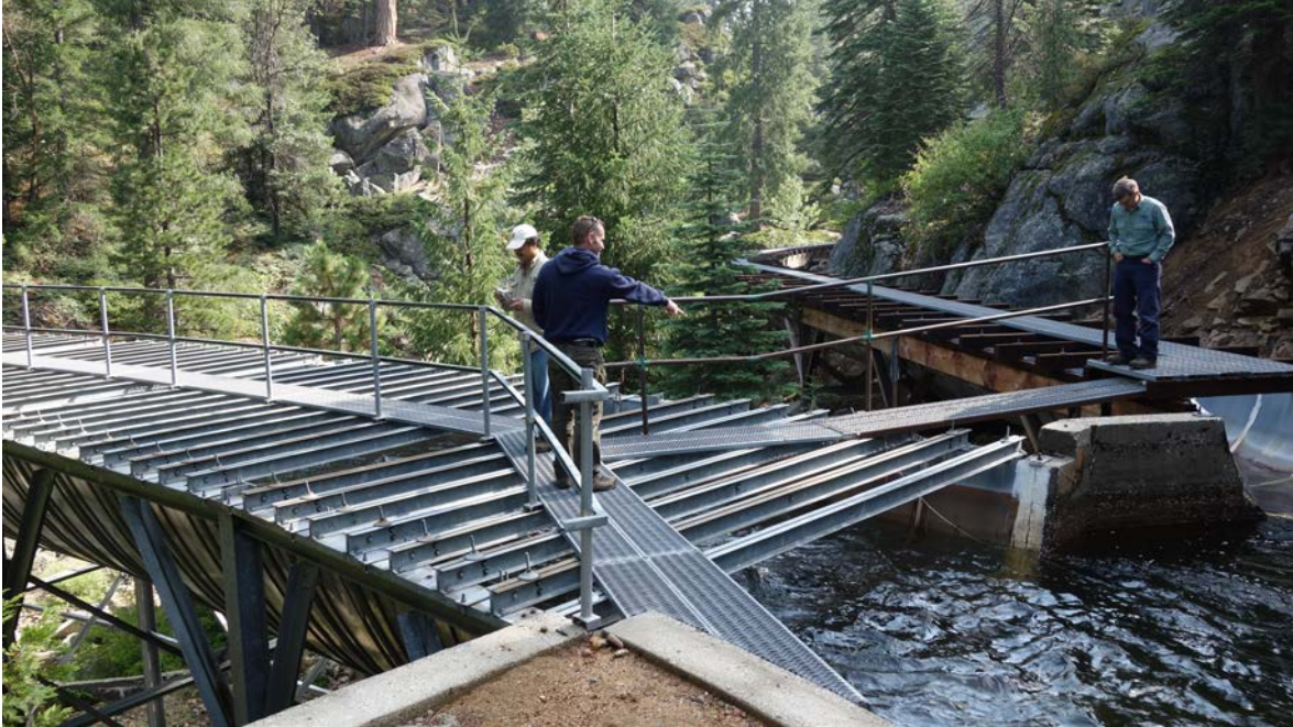
Fall Creek Crossing and Diversion Flume Scale