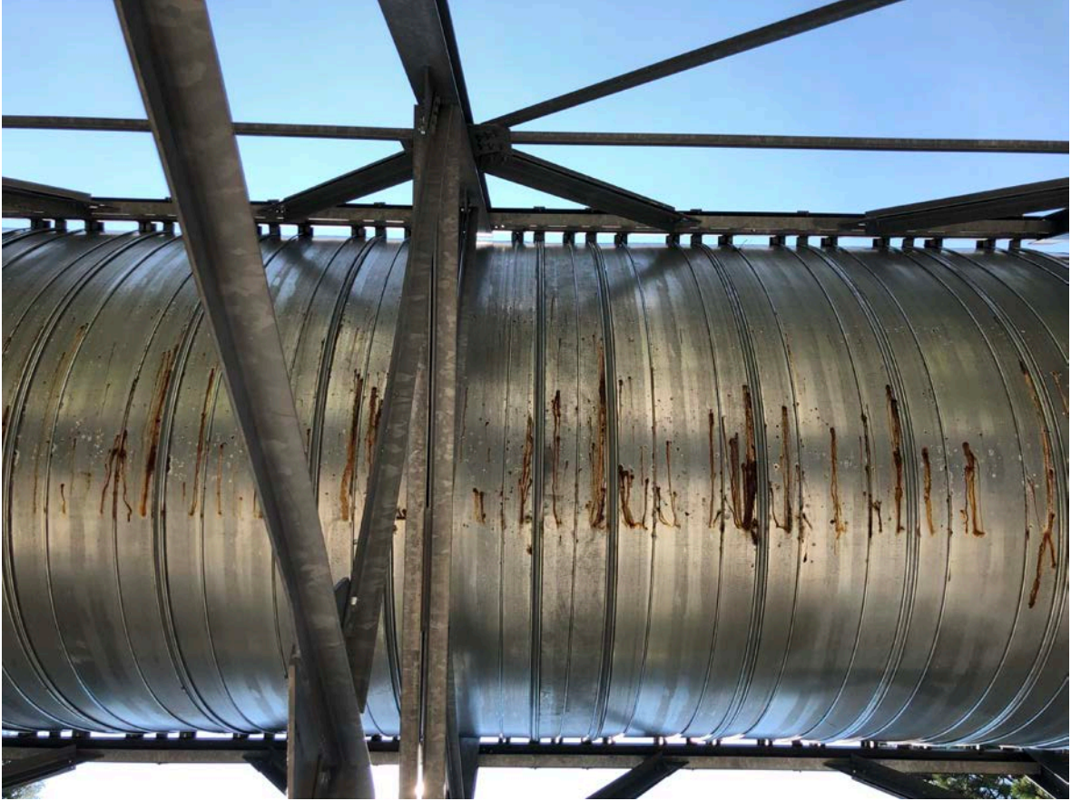
Typical Fall Creek Crossing Flume Corrosion and Leakage